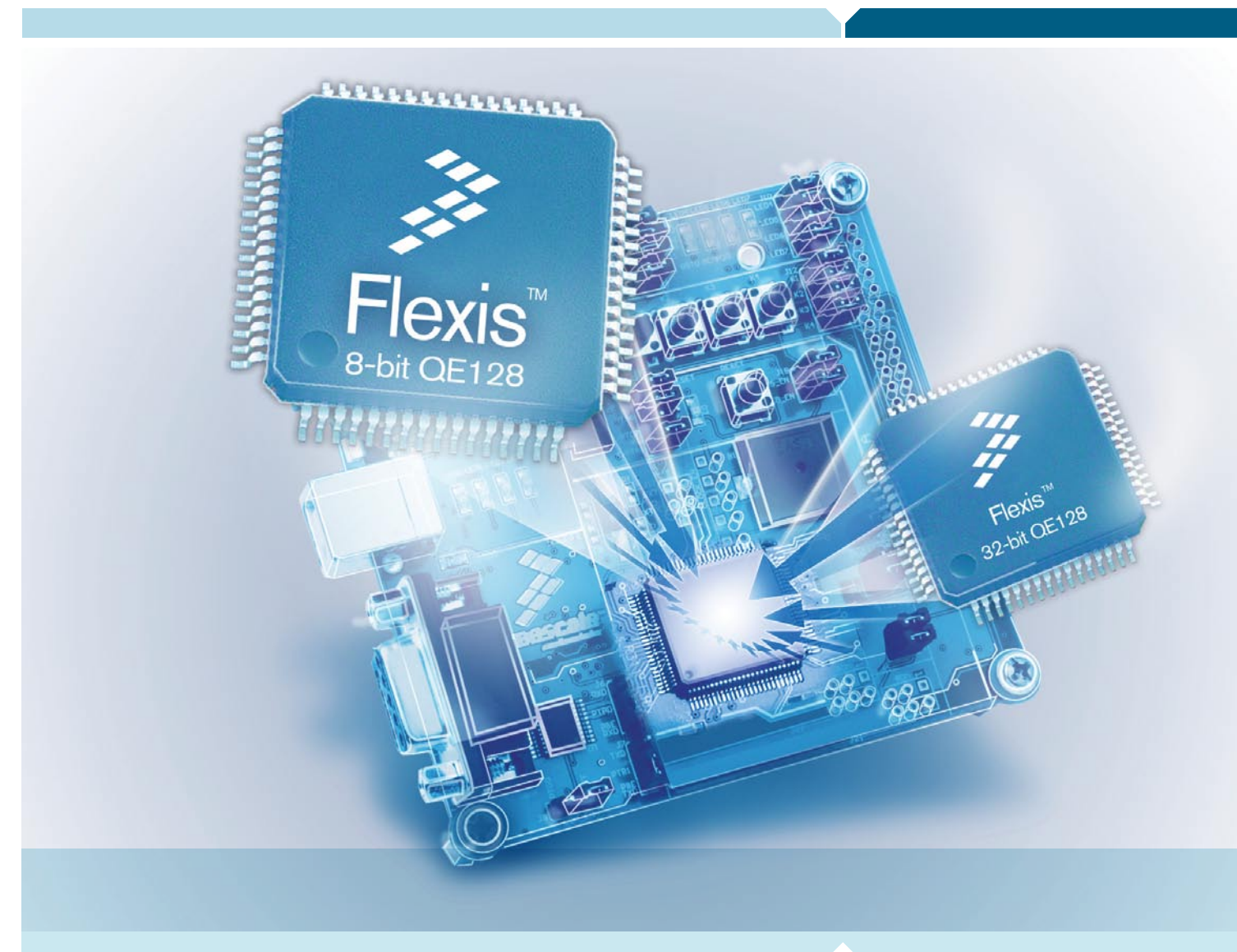
Flexis™ Series—8-bit and 32-bit Compatible MCUs